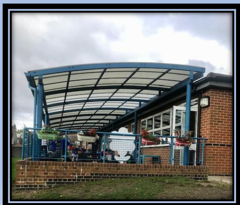
Early Years Building & Playground