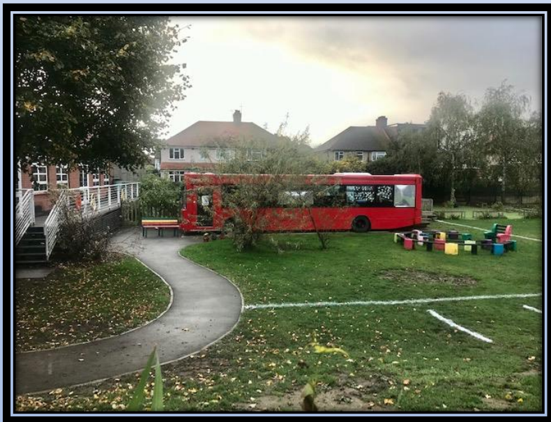
Reception Classes and outside play areas