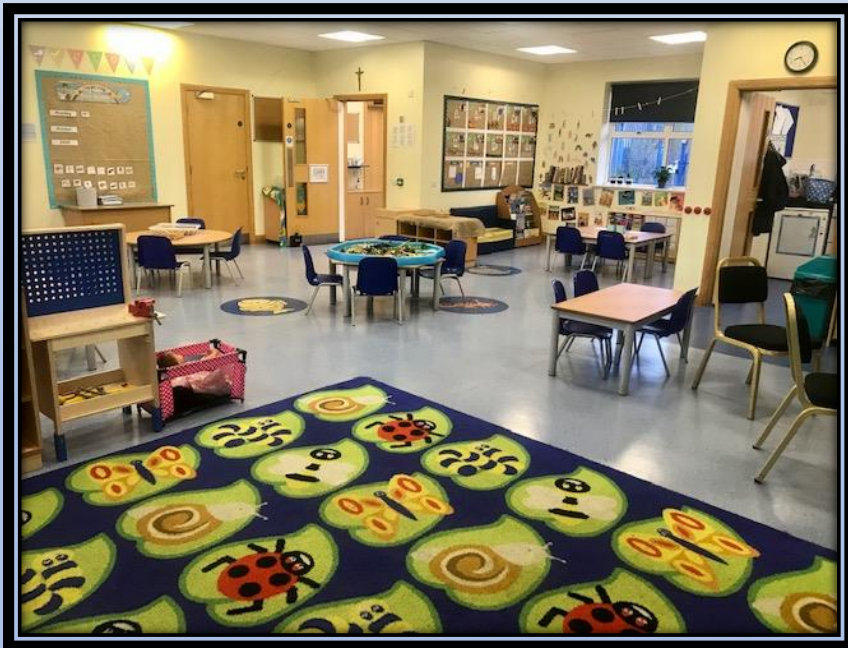
Nursery Class and outside play areas