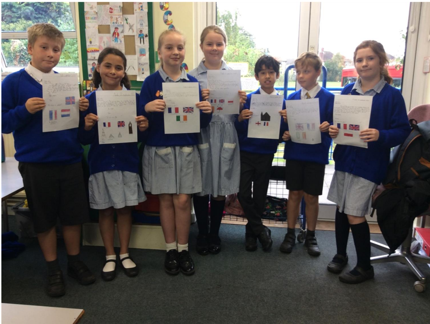
Year 6 writing in French to their French penpals