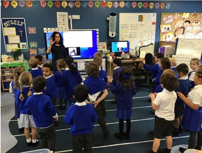
Acting out a French song in Reception